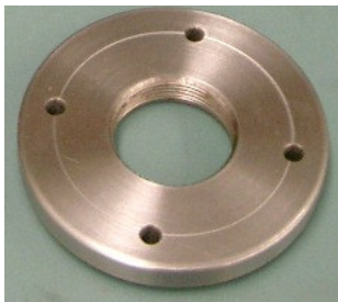
75mm Faceplate - faceplates are exchangeable