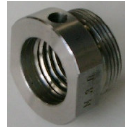
Insert available in most common thread