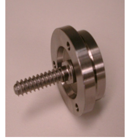
Chuck Screw Faceplate to suit Nova Bonham 100