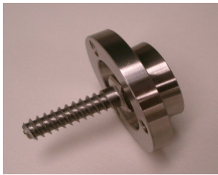
Chuck Screw Faceplate to suit Vicmarc VM90/100