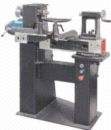
S1000 Omega Lathe

Optional extra - Vermec Version 2kw (3Hp) motor & EVS - POA